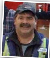
10 Year Service Award