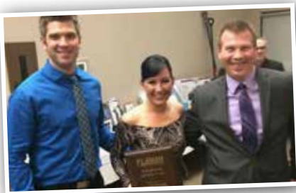
Employee Of The Year