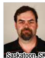
Saskatoon, SK Marty Brooks Parts & Rentals