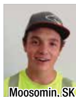
Moosomin, SK Mitchell Yard Support