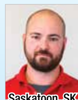
Saskatoon, SK Colin Hounjet Parts & Rentals