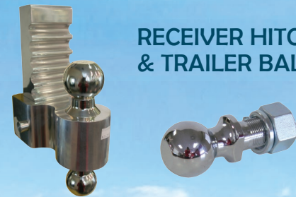
RECEIVER HITCHES & TRAILER BALLS

Available at some locations, please call ahead to confirm.