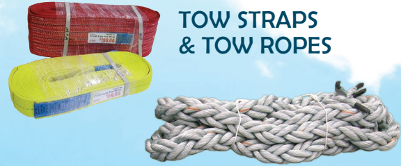
TOW STRAPS & TOW ROPES