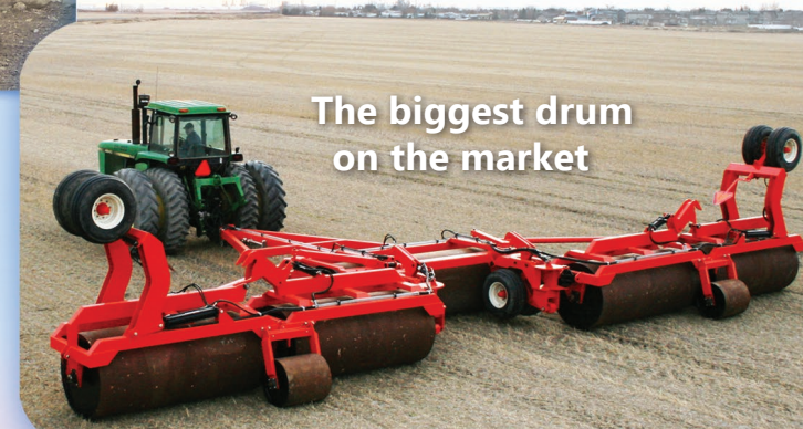
The biggest drum on the market