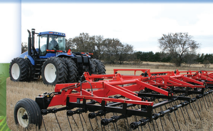
Convenient narrow transport