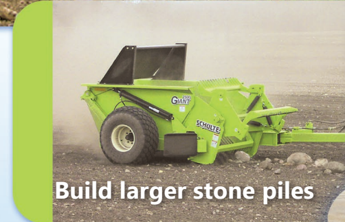
Build larger stone piles