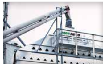
DOUBLE RUN CHAIN AUGERS