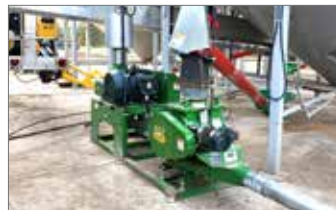
WALINGA AIR SYSTEMS